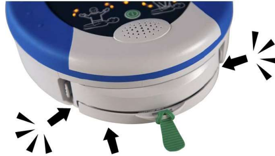
Figure 3 – Inserting a Pad-Pak