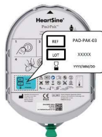
Figure 2 – Pad-Pak Expiry