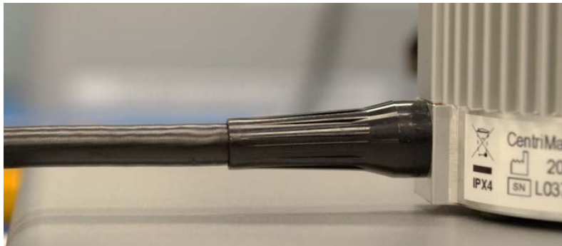
Figure 4: Cable Bend Relief at the Motor