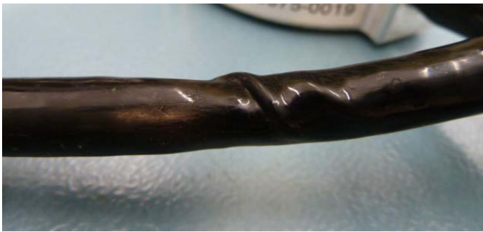
Figure 7: Damaged Motor Cable