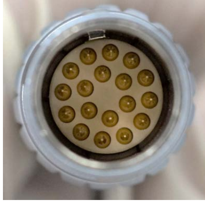
Figure 2: Motor Connector Pin View

Note: If there are any issues while connecting the CentriMag Motor to the CentriMag Console, inspect the Motor port on the rear of the Console for damage, particularly for any broken pins that may be lodged inside.