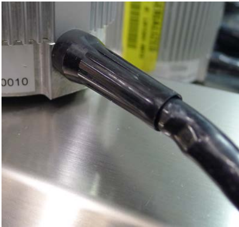
Figure 5: Cable Damage at the Motor Bend Relief