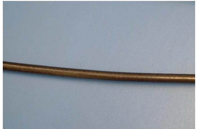
Figure 6: Undamaged and Intact Motor Cable