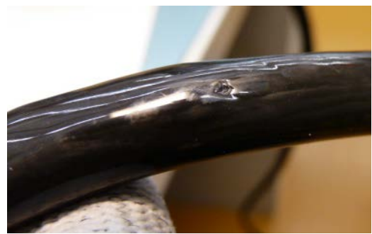
Figure 8: Damaged Motor Cable