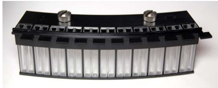
c16000 cuvette segment

The following pictures show examples of cuvette segments where the base is detached from the vertical support post.