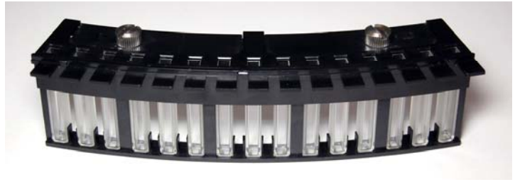
c8000 cuvette segment