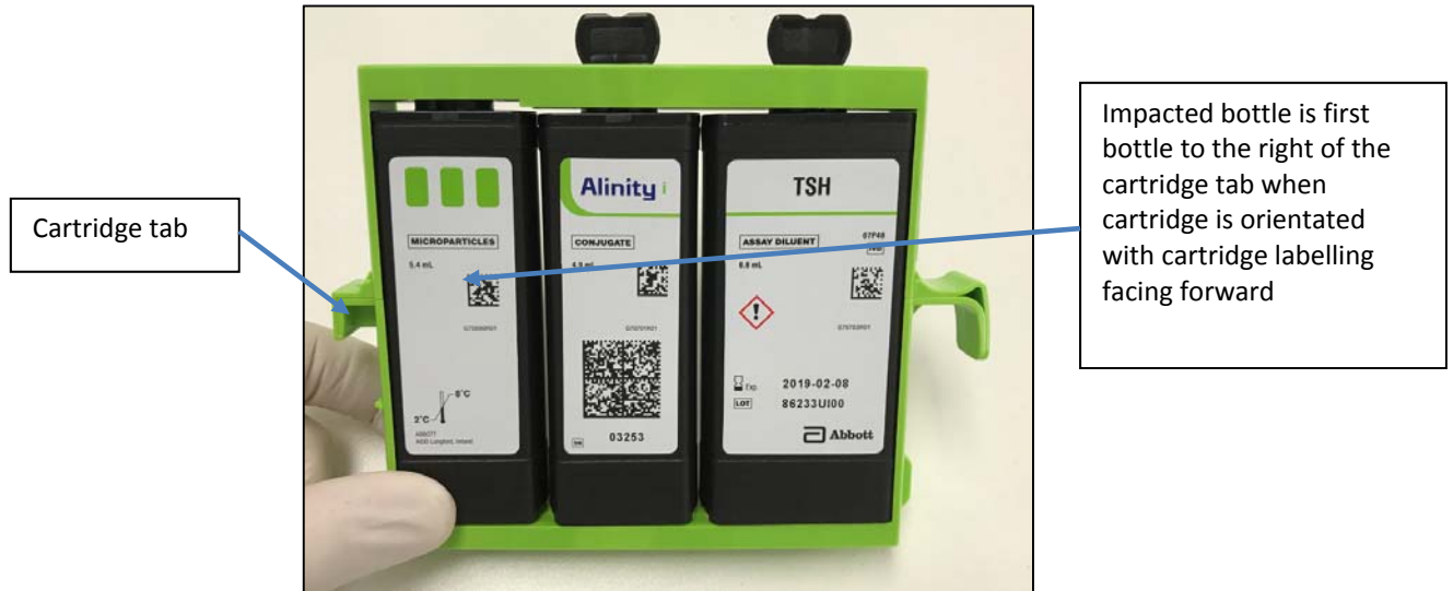
Figure 1: Location of Impacted Bottle.