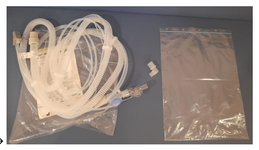
Step 5: Connect the new elbow to the BiCheck sensor of the breathing circuit.