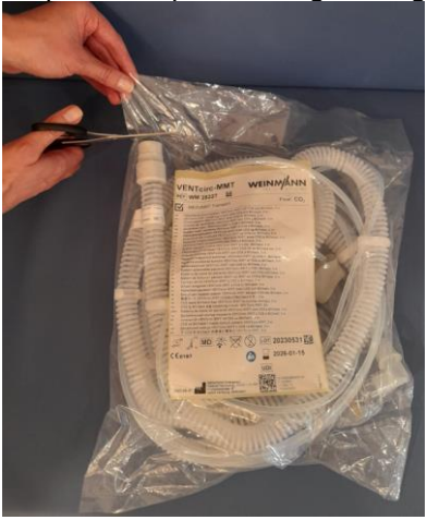
Step 2: Remove the breathing circuit, leaving the article label inside the bag. Do not throw the bag away.

Step 1: Cut open the original bag of the disposable breathing circuit at the top.