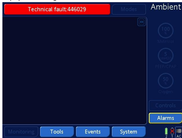
Figure 1: The display indicates “Ambient State”, and a red message with a Technical Fault number (example, a different Technical Fault number might be displayed)

During the “Ambient State” the ventilator will alarm audibly and visually and display the following on the screen: