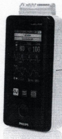
Figure 1 – MX40 device

This Field Safety Notice is to remind customers to review the information in the Intellivue MX40 Instructions for Use (IFU) on how to use Standby mode and to explain under what circumstances, use of or exposure to the device may pose a risk of harm. The notification alerts users of the associated risk of using Standby mode and steps to be taken to reduce or eliminate the risk.