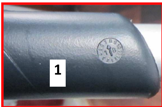
Batches 01, 02, 03, 05, 06, 07 and 08/2018 Only 1 production date

This letter is addressed to the distributors identified as having received the batches concerned. If you have sold or given some of these crutches to other distributors or retailers, please send them this information.