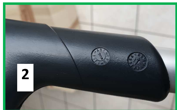
Non-recalled product example

The French ANSM has been informed of this recall.