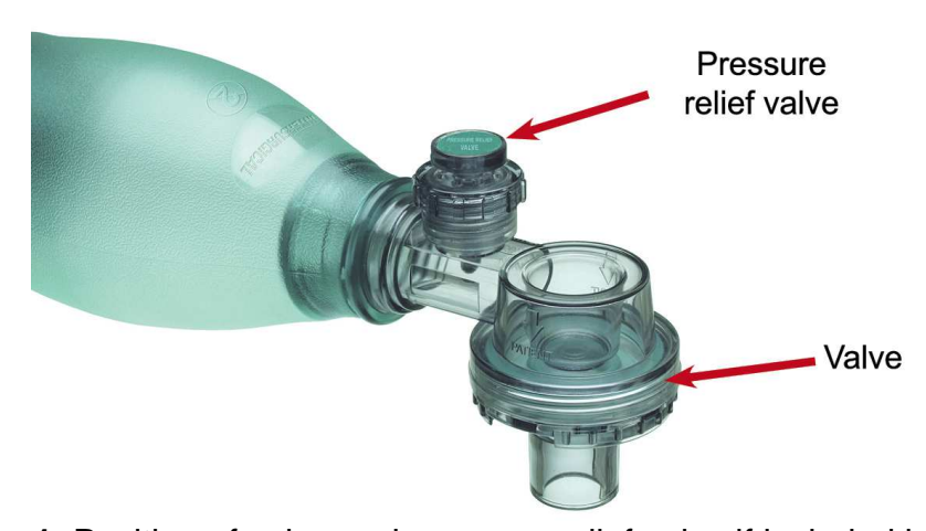
Picture 1 : Position of valve and pressure relief valve if included in the system