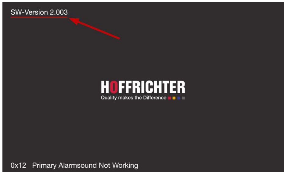
Figure 3: Starting screen on device start with software version printed in the upper left corner (example)